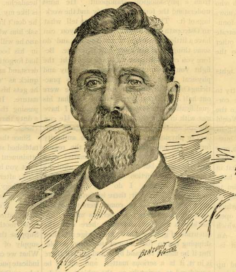
DR. ANDREW T. STILL, FOUNDER OF OSTEOPATHY.

Some people think Osteopathy is a system of massage, others that it is a "faith" cure. I have no "faith" myself, I only want the truth to stand on. Another class think it is a kind of magnetic pow wow. It is none of these, but is based upon a scientific principle. If these electric lights are based upon a scientific prin-