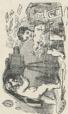
MOORE, The Photographer, Maker of all styles of photographs

Middle of West Side Square. Call and see me.