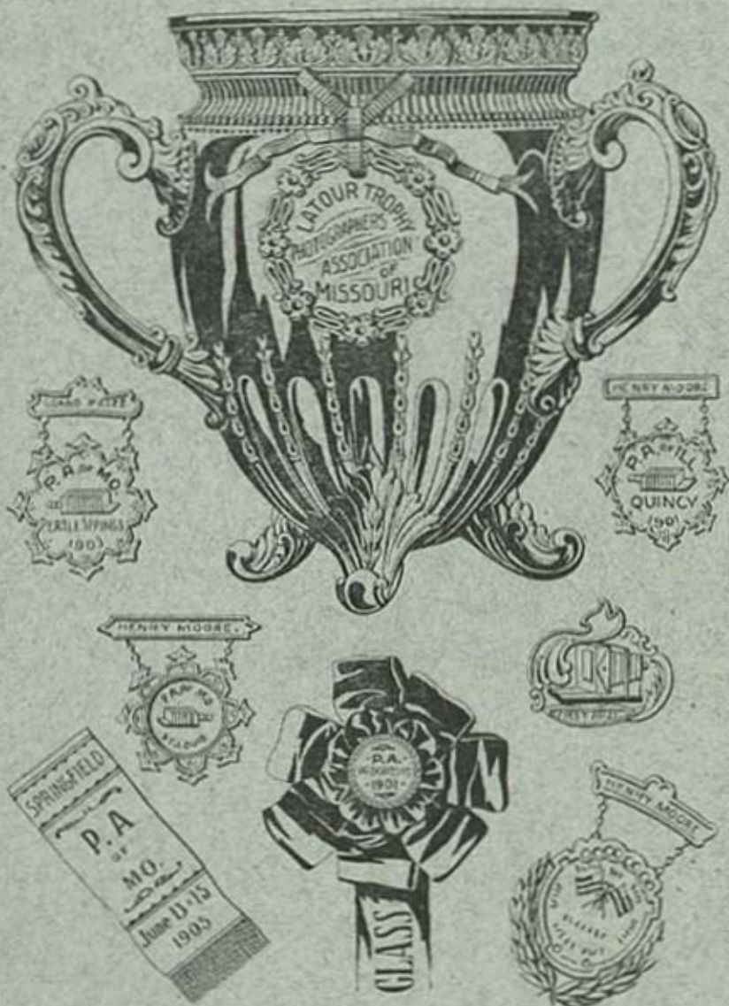
Medals, Trophies, etc. awarded Henry Moore at various Associations.

Visit this Studio and see the class of work we are doing