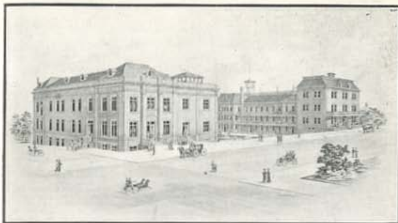
The American School of Osteopathy and A. S. O. Hospital