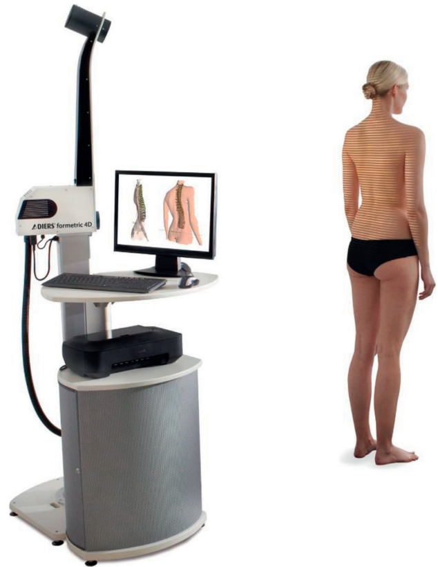
FIGURE 1: Example of formetric 4D projection unit set-up with participant positioning.

The formetric 4D scanning protocol performed in the current study was consistent with the manufacturer's guidelines and has been previously reported in detail [21]. Participants were positioned 2 meters from the formetric 4D projection and camera unit (Figure 1). The unit projected stripes of light on the surface of the participant's back (Figure 2(a)). Images of the surface of the back were recorded, digitized, and represented in 3D space (Figure 2(b)). Surface mean and Gaussian curvature were calculated (Figure 2(c)), and the underlying spine was rendered (Figure 2(d)). Each scan recorded 12–13 images over 6 seconds (2 Hz) and was processed based on the manufacturer's instructions. The instrument then produced 40 named spine shape parameters from a single image that is closest to the average position of the participant. Being