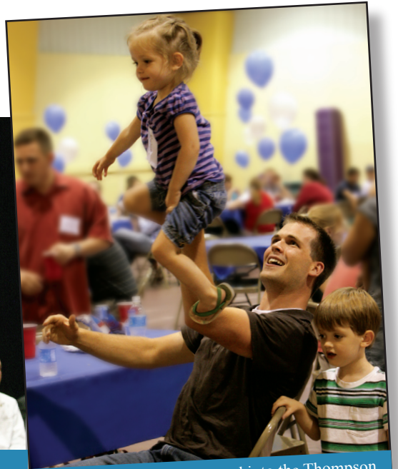
The President’s Picnic moved into the Thompson Campus Center because of rain