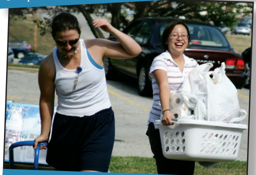
Some KCOM first-year students began moving into new apartments a week before classes began