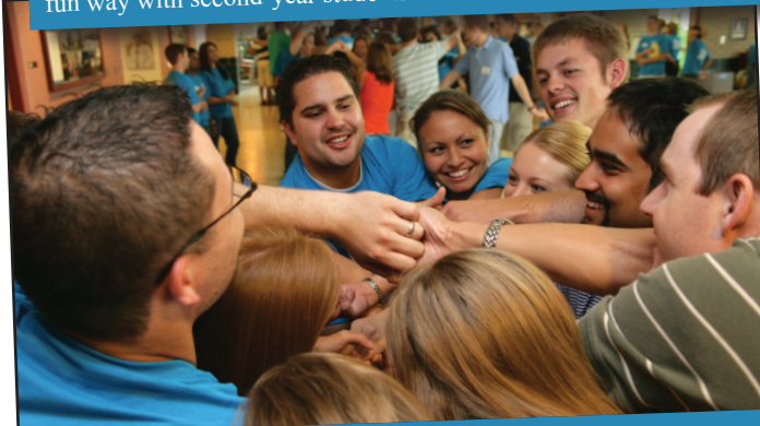
172 students plus 120 volunteers participated in the ice-breaker games