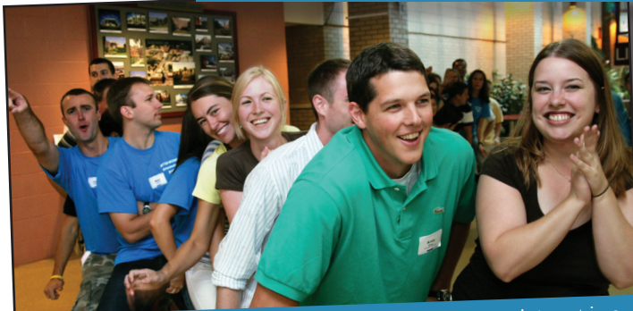
SGA “ice-breaker” games gave new students a chance to interact in a fun way with second-year students