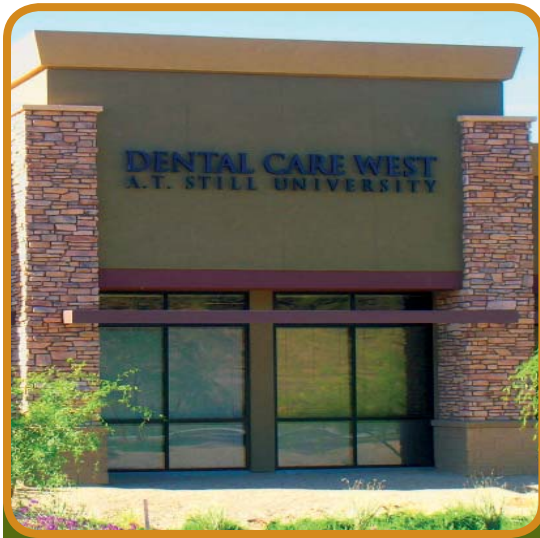
The Thunderbirds Charities Special Care Unit at Dental Care West is equipped with a motorized wheelchair lift, making dental care more comfortable and accessible for patients.