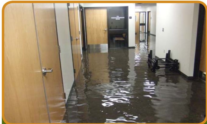
Standing water in the CITC basement.

Maintenance and housekeeping crews worked 36 hours straight to save as much as possible, but losses will likely surpass $2 million. To view security camera footage of the flood, visit www.atsu.edu/library/flood.htm .