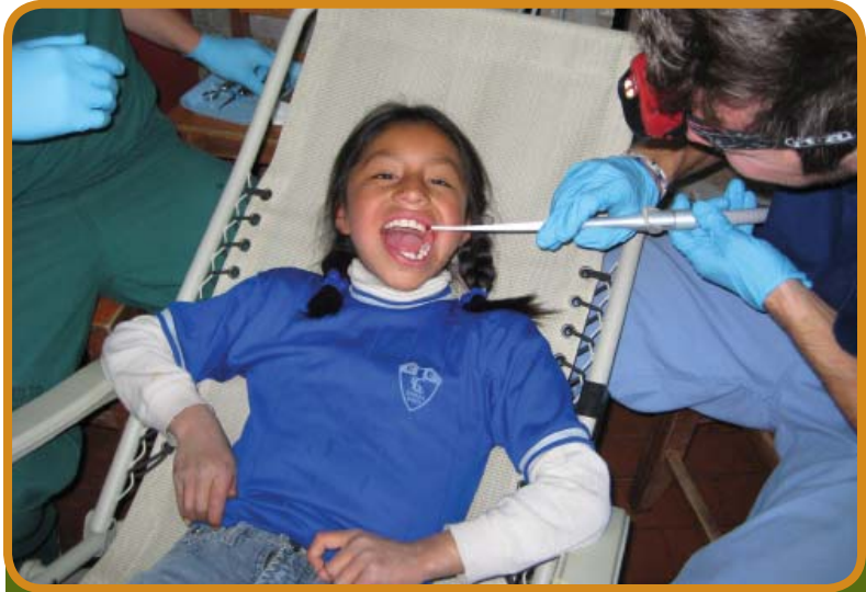
A patient smiles after her extraction at Cusco’s walk-in center.