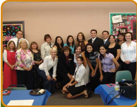
The occupational therapy class of 2009.