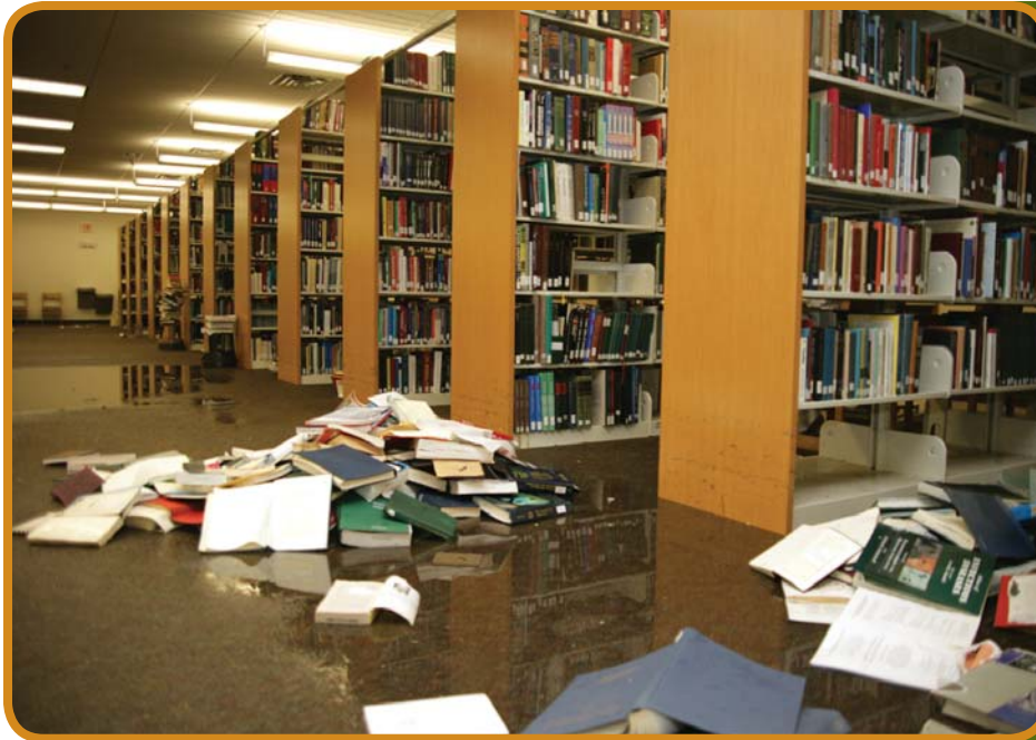
Hundreds of books lay damaged on the A.T. Still Memorial Library floor.