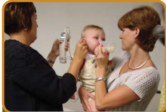
A baby's hearing is tested with otoacoustic emissions at the Diagnostics and Amplification for Infants and Toddlers.