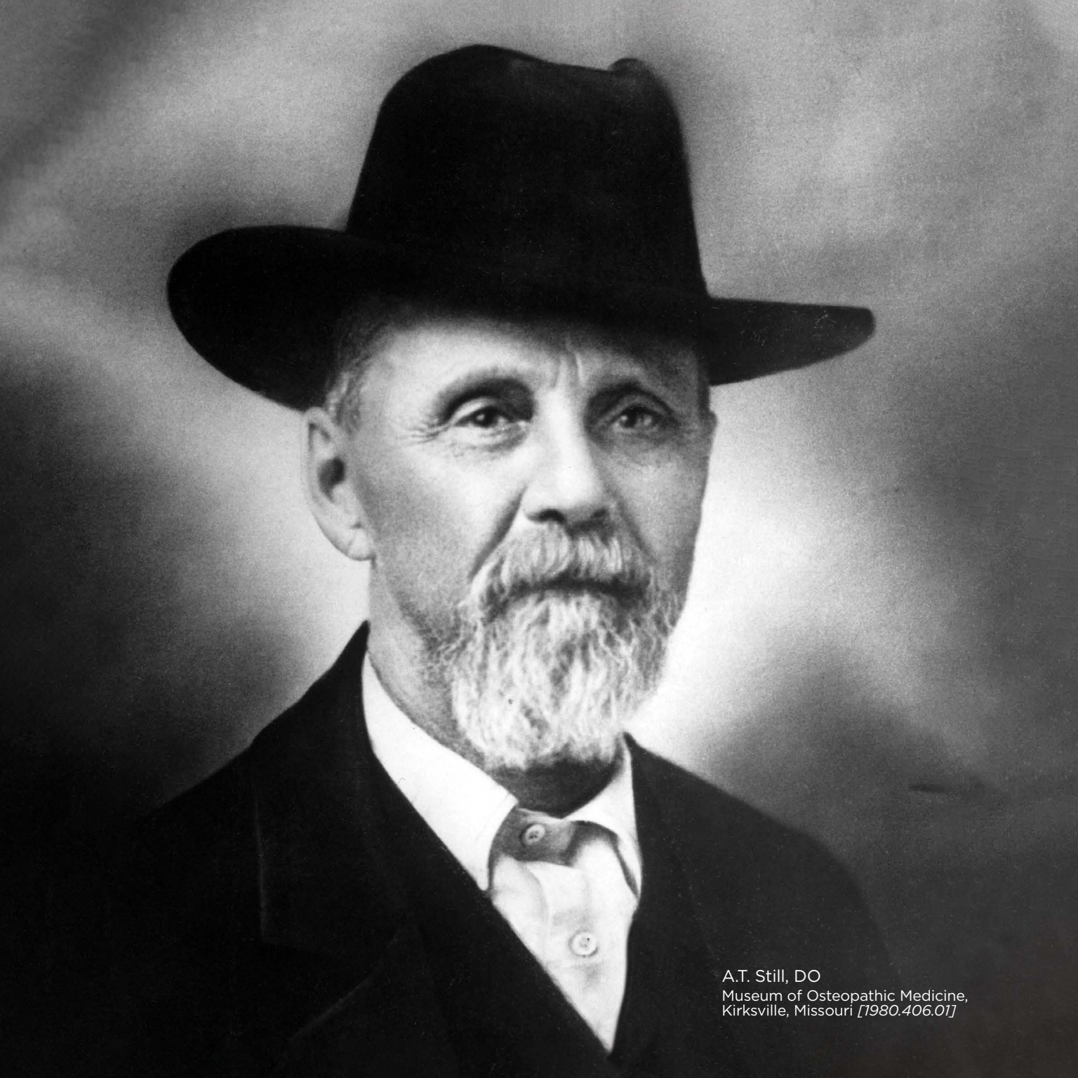
A.T. Still, DO Museum of Osteopathic Medicine, Kirksville, Missouri [1980.406.01]